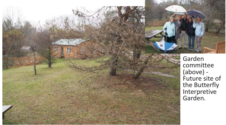
Garden committee (above) - Future site of the Butterfly Interpretive Garden.